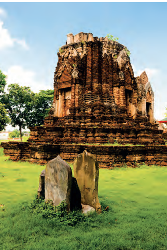
Wat Chula Mani

a major role in fostering Buddhism in the province.