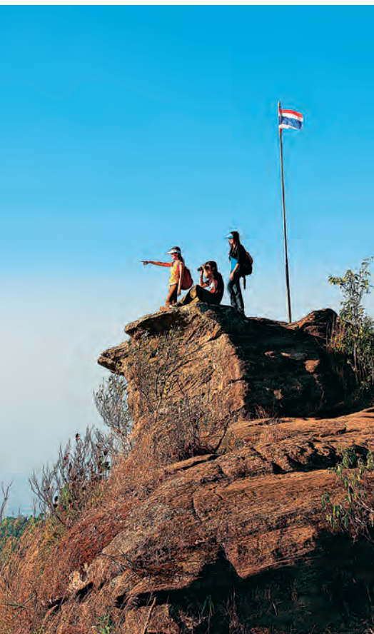
Pha Chu Thong, Phu Hin Rong Kla National Park