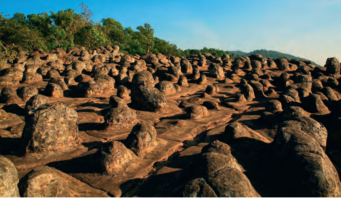
Phu Hin Rong Kla

Km.53, covering an area of about 10 sq. kms., and Namtok Heo Sai and Namtok Sai Thong, located on the same trail, reached on foot, 1 km. and 1.5 km. respectively off the main road at Km.67. There are also attractions on Highway 2216 (Lom Kao-Huai Sanam Sai); such as, Pha Lom-Pha Kong which are 5 kms. from Km.40 and Tham Yai Nam Nao near Km.60. For more information, please contact the Department of National Parks, Wildlife and Plant Conservation at Tel. +66 2561 0777, or visit portal.dnp.go.th .