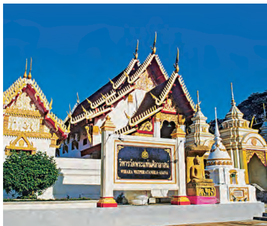
Wat Phra Tan Sila - Asana

An ancient community dating from the Ayutthaya period, Laplae is an attractive place to visit with old wooden houses, hand-woven textiles and other craft specialties. It is also a major producer of langsat, the province's famous fruit, as well as a local variety of durian called "long laplae". It lies west of town via Highway 102 for 3 kms., then to the right along Highway