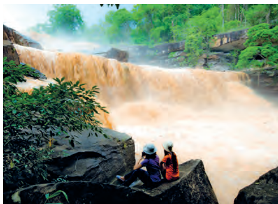
Namtok Kaeng Sopha

at Tel. +66 2561 0777, or visit portal.dnp.go.th .