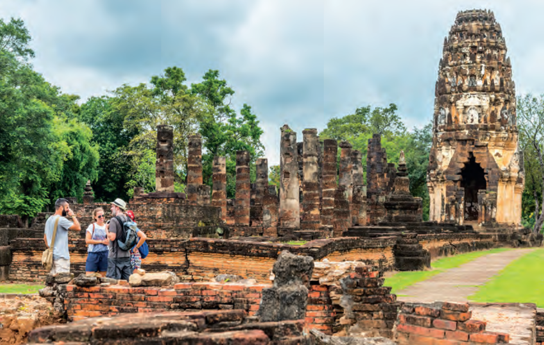
Wat Phra Phai Luang