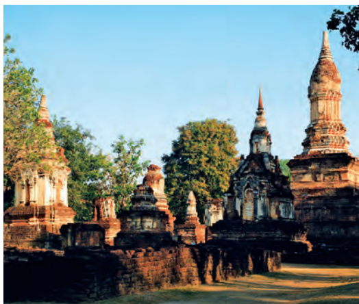
Wat Chedi Chet Thaeo

are decorated with unglazed ceramic designs. The central laterite stupa is surrounded by lamp-posts and accessible by a set of narrow stairs.