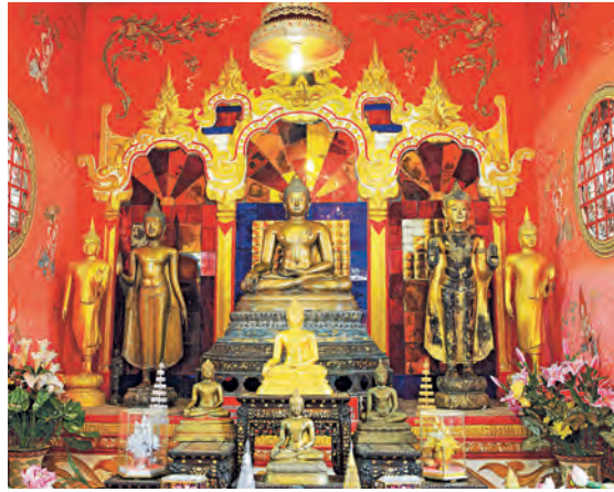
Wat Tha Thanon

Situated east of the town centre about 3 kms.