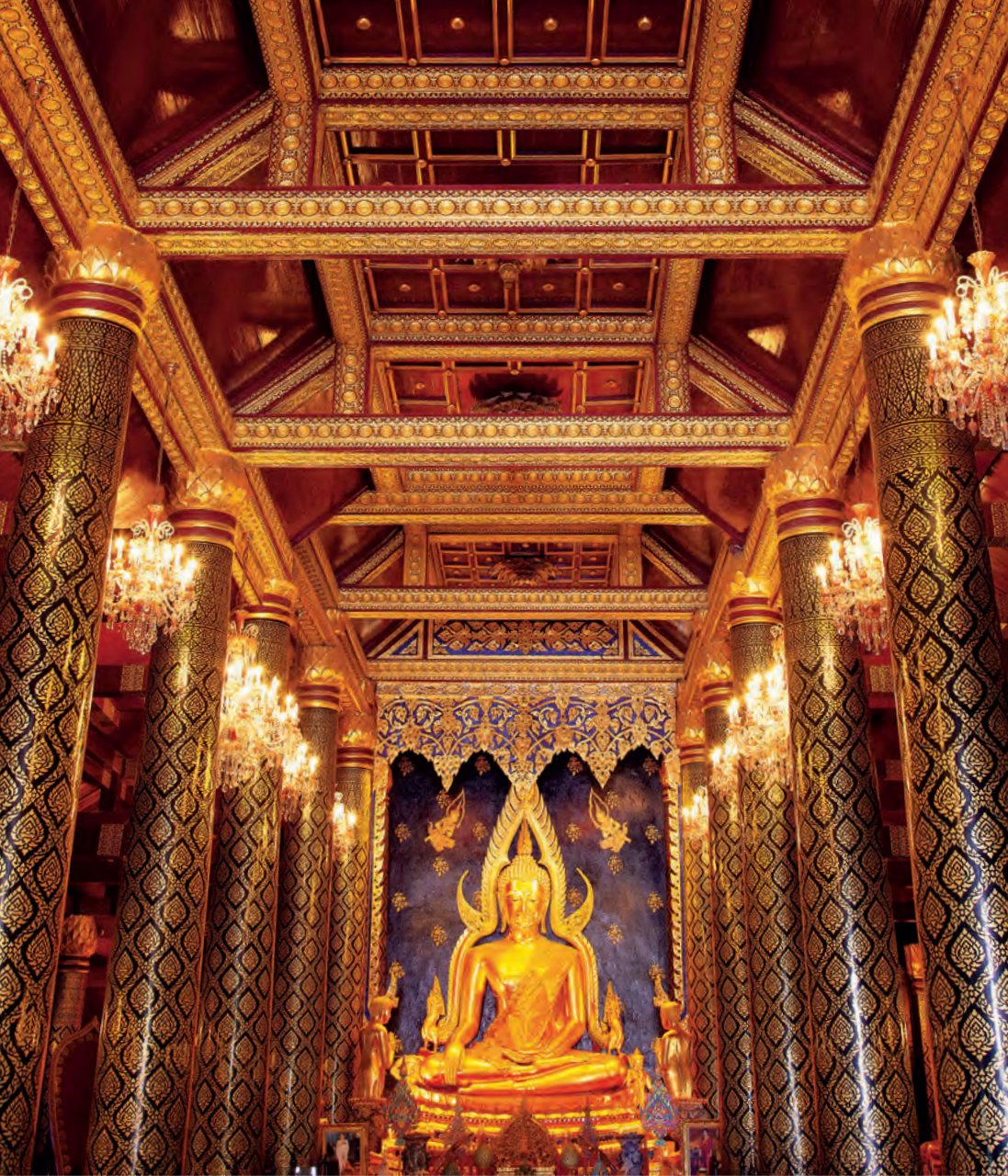
Phra Phuttha Chinnarat