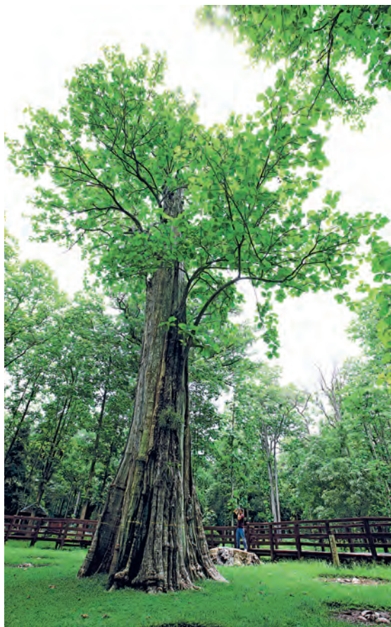
Sak Yai Forest Park

1146 and 1047, features the largest teak tree in the world. It has a circumference of 9.87 m. and an age of about 1,500 years. Unfortunately, its top was broken off in a storm, cutting its height from 48.5 m. to 37 m., but it is still alive.