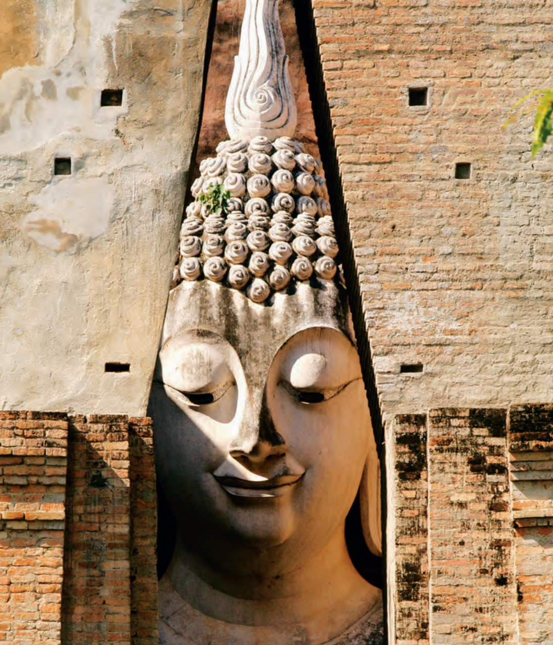
Phra Achana, , Wat Si Chum