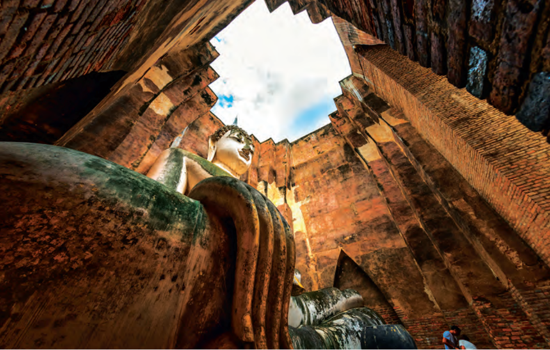
Wat Si Chum

contains ruined Buddha images in four postures – sitting, reclining, standing and walking. A Sivalinga (phallic emblem of Hindu gods) was unearthed in the compound of this sanctuary.