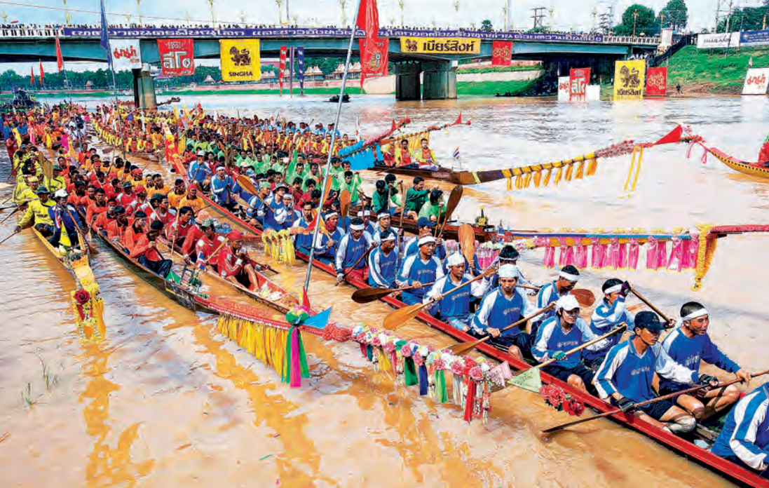
Long Boat Races & Fair

rapids and an event called “Tasting Kaeng Song Coffee and Rafting on the Khek River” which takes place around July of every year. At this festival, visitors get to experience the excitement of rafting along the river, as well as to taste the Kaeng Song coffee, which is the local Arabica coffee.