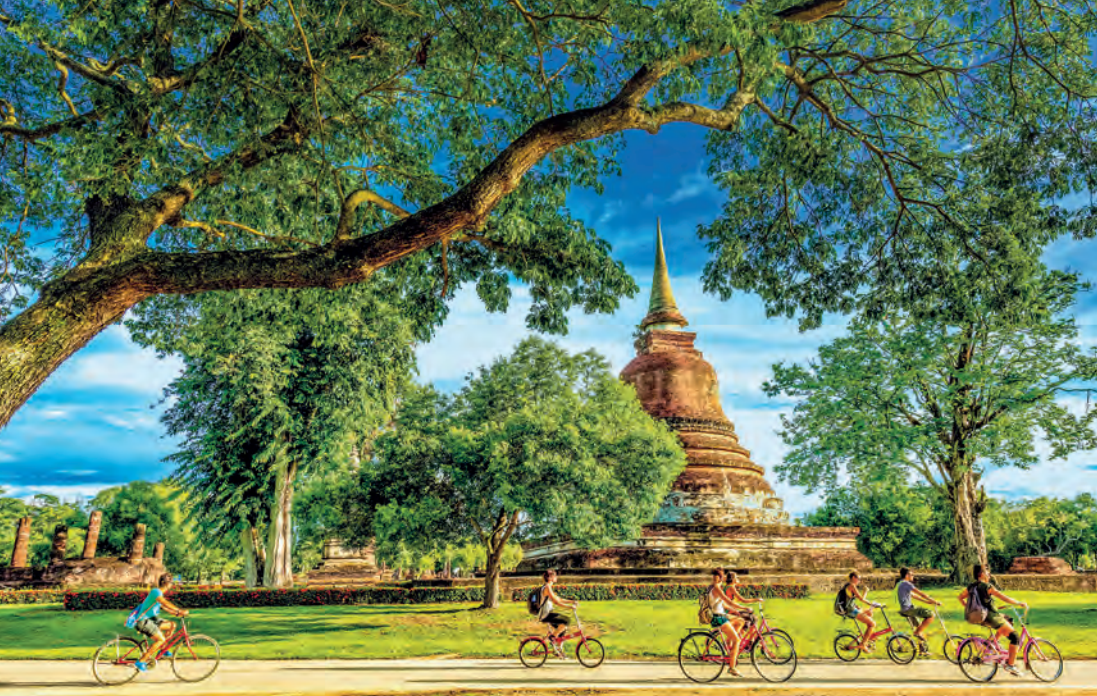
Wat Chana Songkhram

main sanctuary and stucco standing Buddha image measuring four niches. There is a wihan to the front, and to the east of the pond is an island with an ubosot (assembly hall). This edifice has crumbled and only its pedestal and laterite columns remain. Many monuments and magnificent scenery are visible from this location.