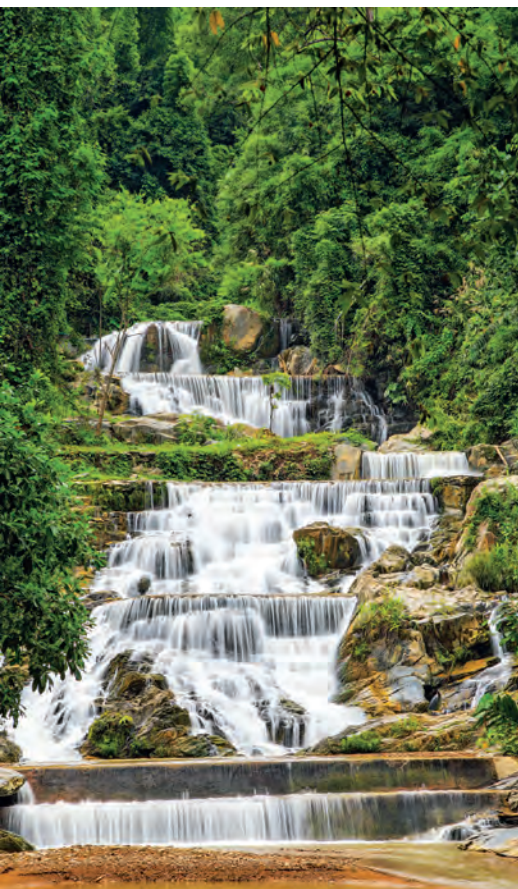
Namtok Mae Phun