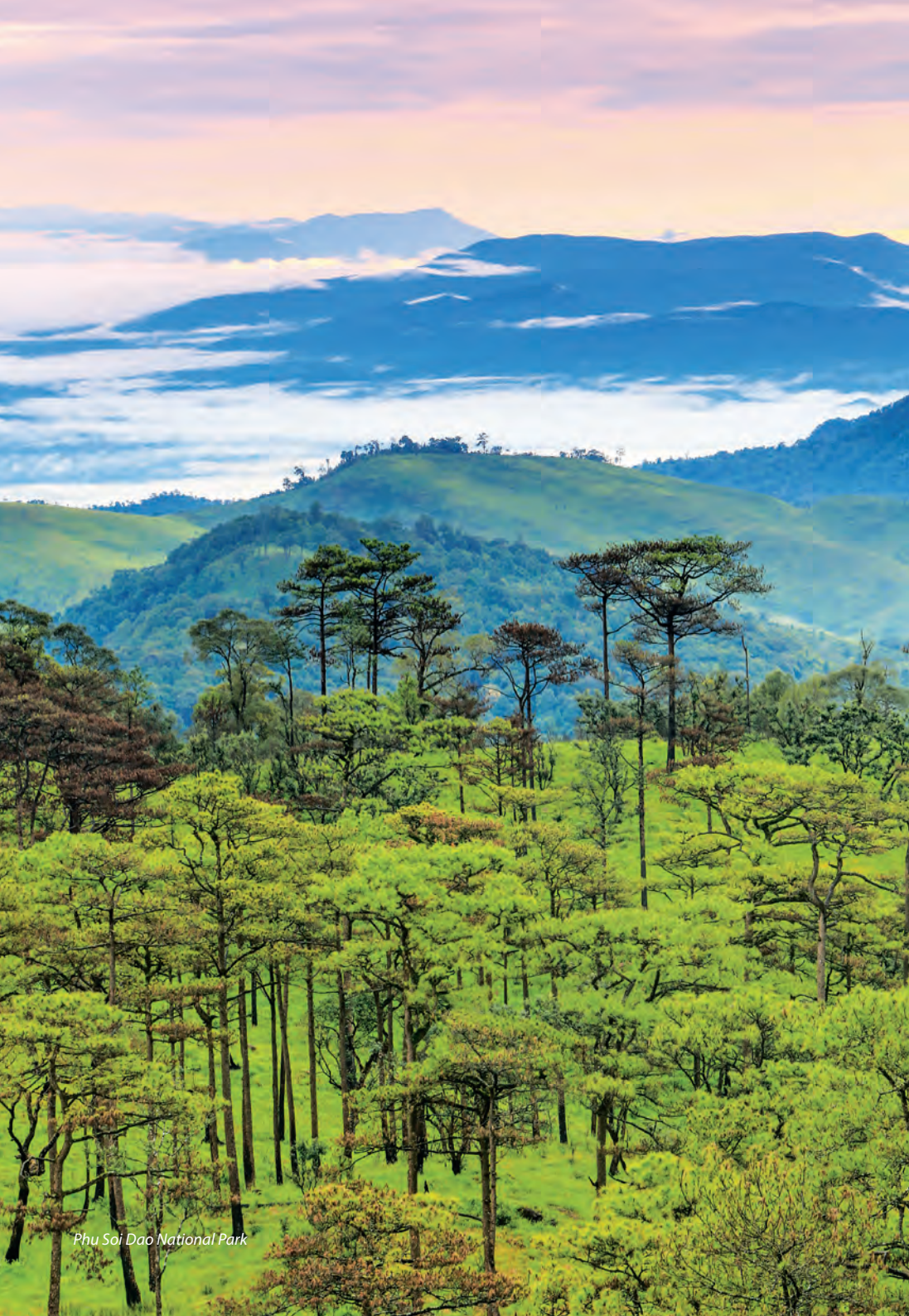
Phu Soi Dao National Park