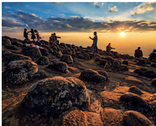
Lan Hin Pum, Phu Hin Rong Kla National Park