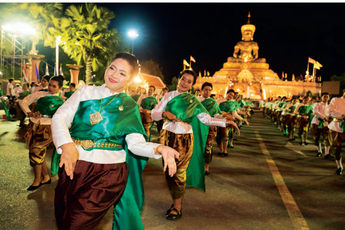
Traditional Dance Performance

the image is carried around town and then put under a tent in Wat Trai Phum, so Buddhists can pay respect by applying gold leaf to the statue. In the evening, people gather at the temple to pray, as well as to enjoy various kinds of entertainment. The next morning, people make merit by offering food and other necessities to the monk, as it is Sat Thai Day. The Buddha image is then taken to be immersed in the Pasak River by the governor of Phetchabun and traditional dances are performed as a sign of respect. After the ceremony, the water in the river is regarded as sacred, so people swim in it or take the water to drink, and the festival concludes with the traditional long boat races.