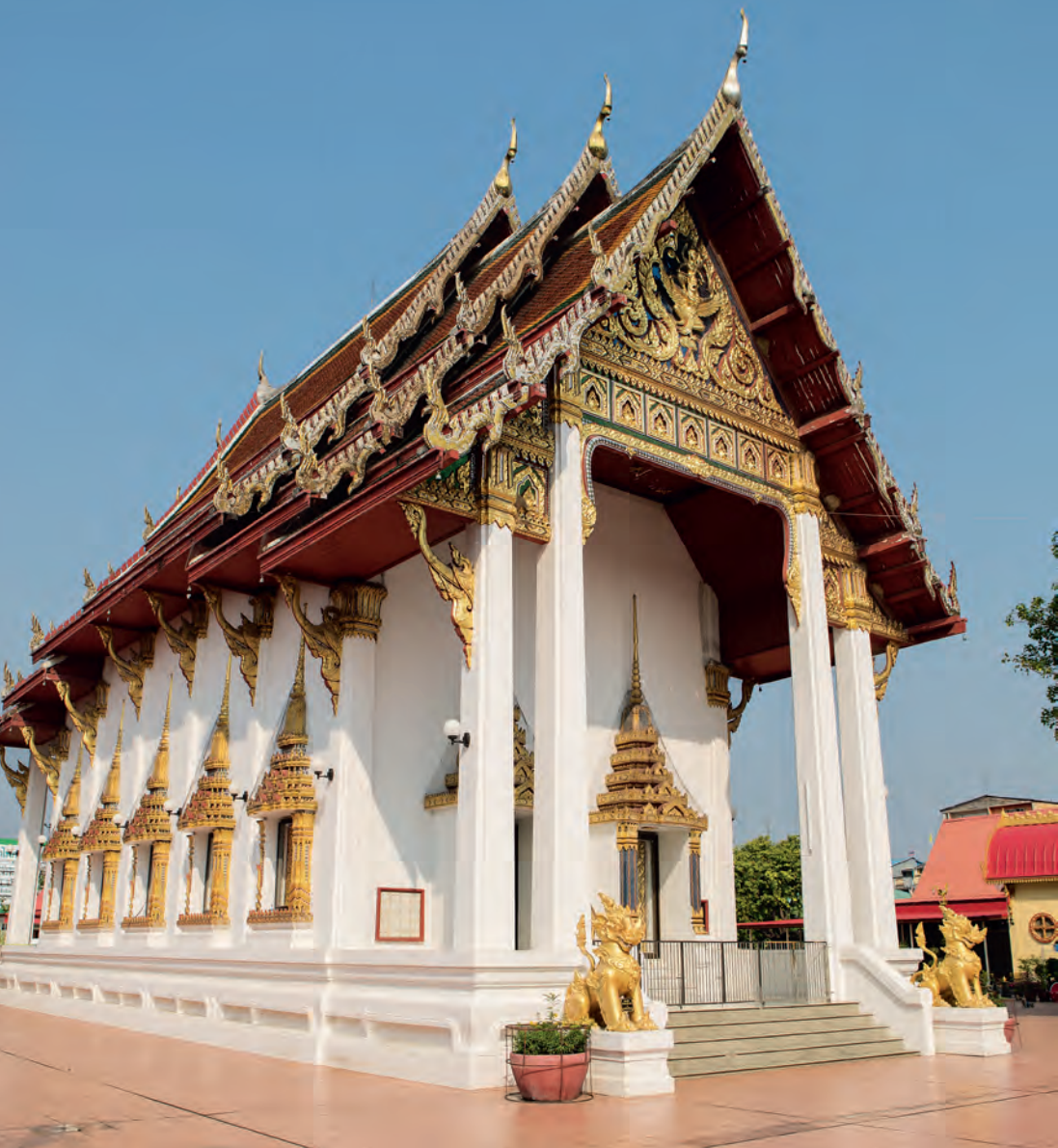
Wat Tha Thanon