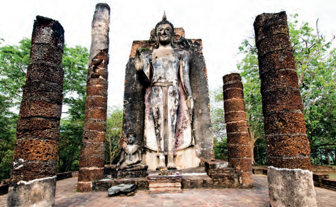
Wat Saphan Hin