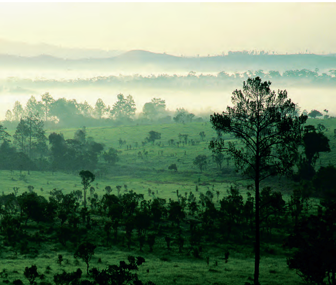
Thung Salaeng Luang National Park

Nok Air operates daily flight from Don Mueang Airport in Bangkok to Phitsanulok. Call +66 2900 9955, 1318 or visit www.nokair.com for more information. Thai AirAsia , call +66 2515 9999 or visit www.airasia.com