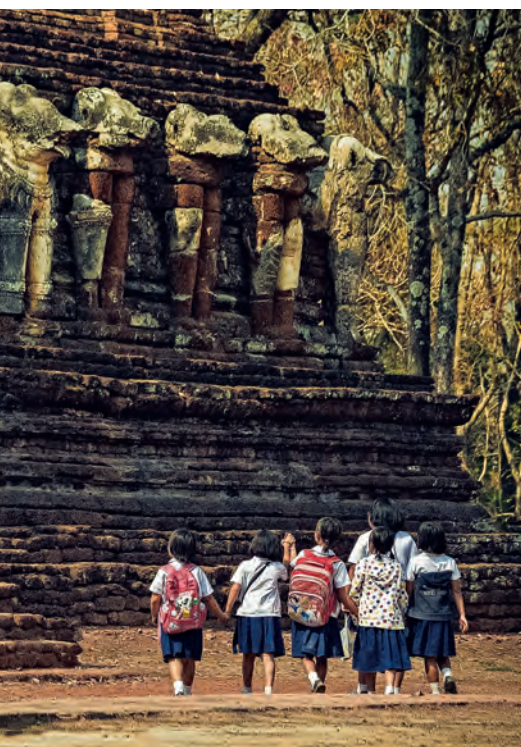
Wat Chang Lom

elephants. This type of elephant-decorated chedi is to be seen in many ancient towns of the Sukhothai period; for example, Kamphaeng Phet and Si Satchanalai.