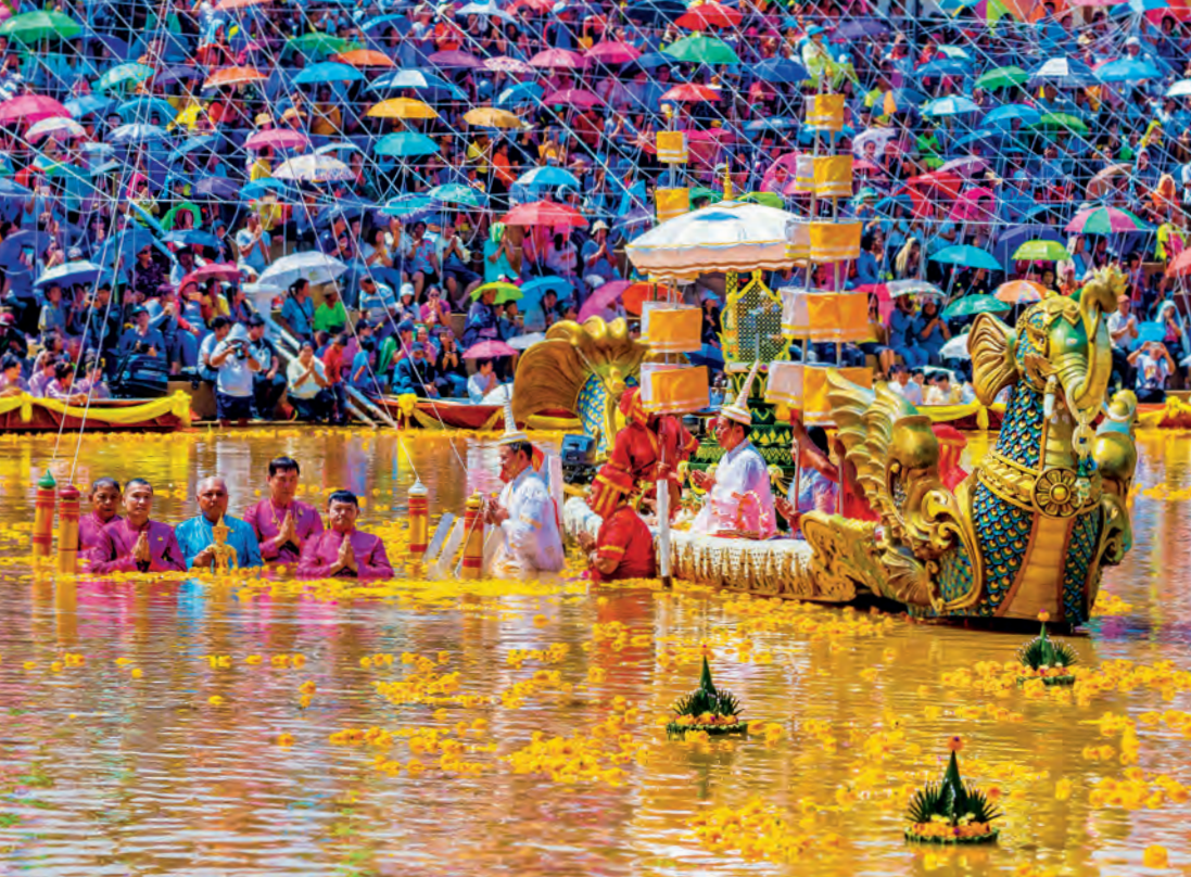
Um Phra Dam Nam Ceremony