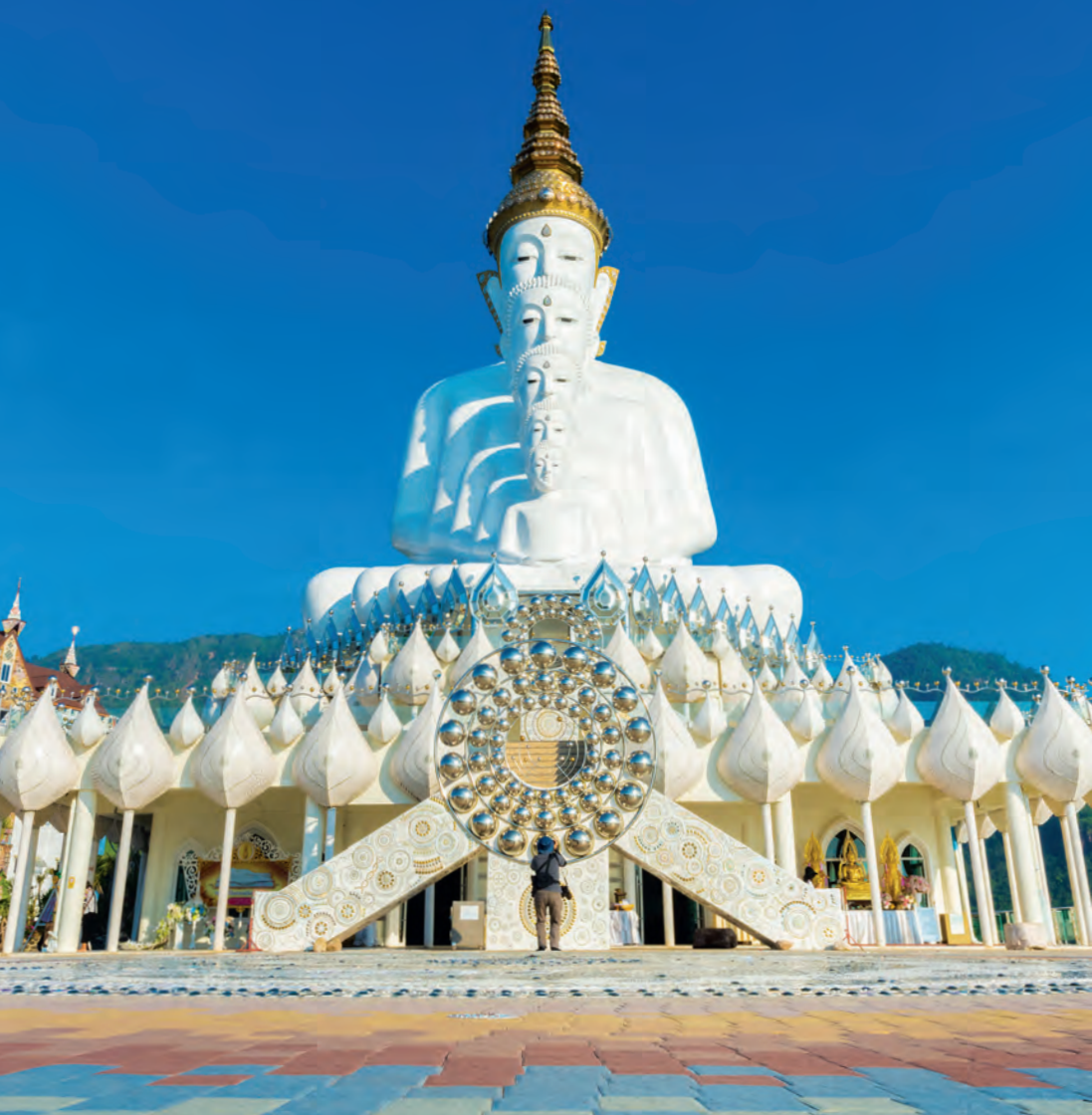
Wat Pha Son Kaeo