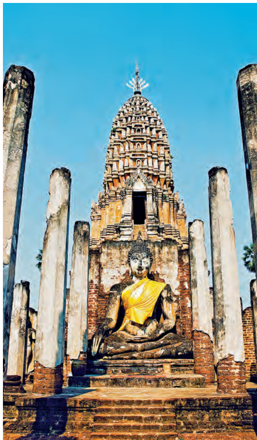
Wat Phra Si Rattana Mahathat

Si Satchanalai Historical Park contains the remains of Sukhothai-era Structures in a park and setting similar to Sukhothai Historical Park. The 13 th to 15 th century ruins of 134 structures have been discovered and are located beside the Yom River among hills and are less restored than those of Sukhothai's. The ancient site was the kingdom's second city and the residence of