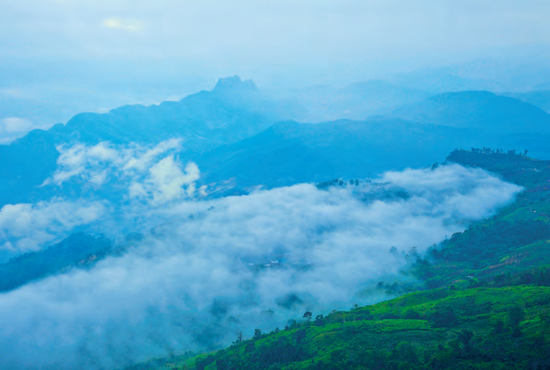
Phu Thap Boek

(Phitsanulok-Lom Sak) at Ban Camp Son, and off Highway 21 at Ban Na Ngua, about 13 kms. north of town. Interesting places include various viewing points, remains of guerrilla bases, a war memorial, a weapon museum, a stupa containing a holy relic, the Si Dit Falls and a royal palace. On the way to Khao Kho, visitors can visit the Hmong Market, which is where the Hmong hill-tribe people come to sell the hill-tribe handicraft and products from their farm.