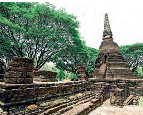
Wat Nang Phaya