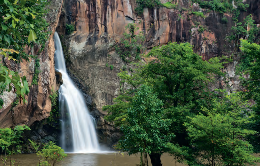
Namtok Chat Trakan National Park

savanna. Thung Non Son, a grassy plateau in the heart of the park, abounds with wild flowers in October to December. From Ban Nong Mae Na, it takes 16 kms. by car and a further 15 kms. on foot to get to the park. For more information, please contact the Department of National Parks, Wildlife and Plant Conservation at Tel. +66 2561 0777 or visit portal.dnp.go.th .