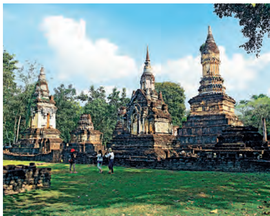
Wat Chedi Chet Thaeo

The hilltop temple is situated 200 m. from Phanom Phloeng Hill. A huge bell-shaped chedi on a five-tiered base marks the centre of the temple. Ruins of a wihan, chedi and fragments of huge stucco figures scattered on the ground. The similarity between some figures here and those at Wat Chang Lom lead to the belief that King Ramkhamhaeng the Great had this temple constructed.