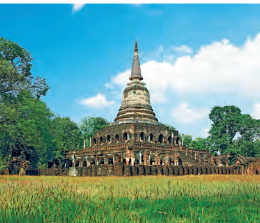
Wat Chang Lom

a square base, marks the centre of the temple. A steep staircase in front of the prang leads to a room where a reliquary is enshrined.