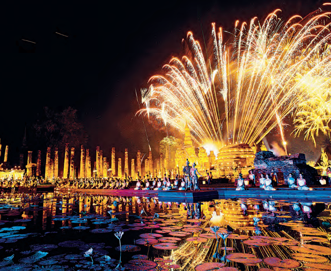
Sukhothai Loi Krathong and Candle Festival