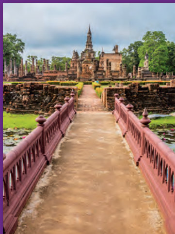
Sukhothai Historical Park