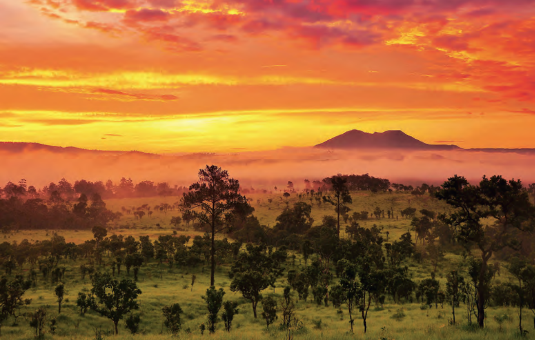
Thung Salaeng Luang National Park

period to deter raids from Lanna and Burma and the remnants can be seen to the north and east of town. Part of the old 12 m. wide city moat still exists to the west of town parallel to Phra Ruang Road. Located within the compound of Phitsanulok Phittayakhom School are the remains of Chan Palace, the birthplace of King Naresuan the Great, which are being excavated at present.