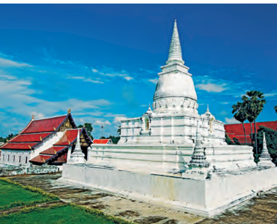
Wat Phra Boromathat Thung Yang

are rare wall murals of the Early Rattanakosin period style depicting the Jataka and assemblage of celestial beings.