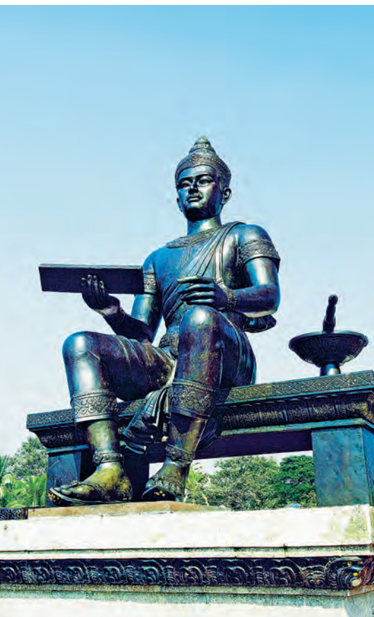
King Ramkhamhaeng the Great Monument