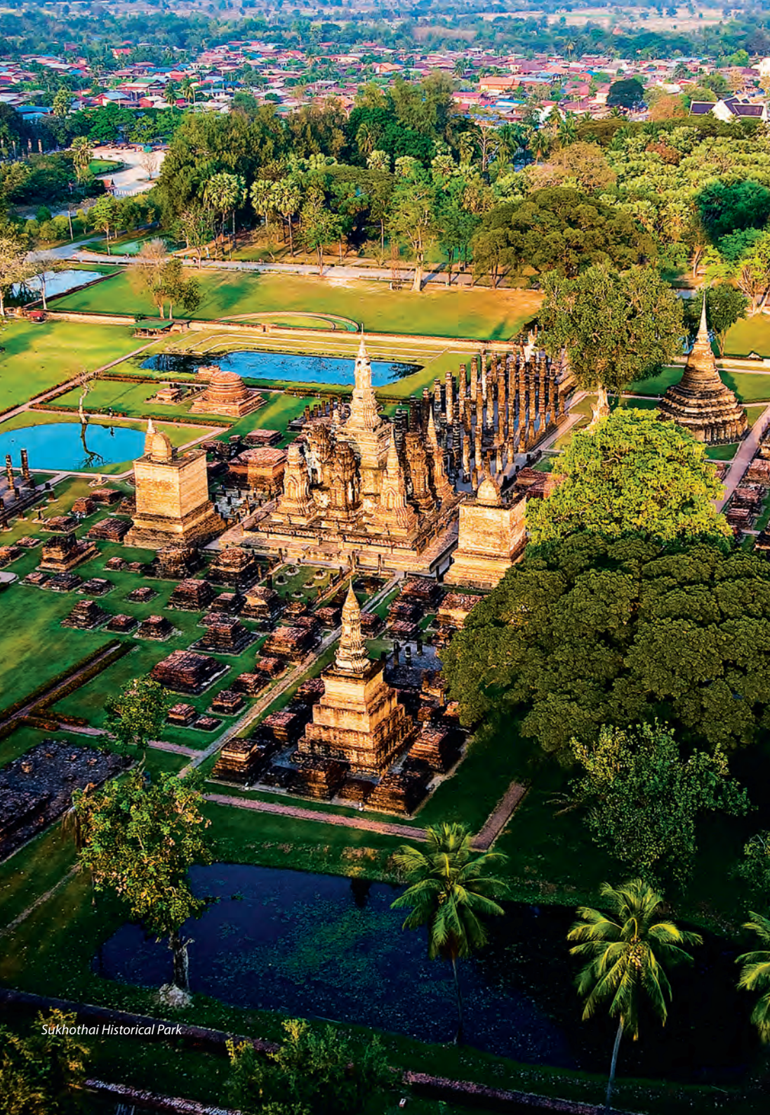
Sukhothai Historical Park