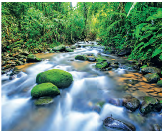
Namtok Phu Soi Dao

Amphoe Huai Mun, Amphoe Nam Pat of Uttaradit Province and Amphoe Chatrakarn of Phitsanulok Province, the park's office is located at Amphoe Nam Pat near Namtok Phu Soi Dao, which is the most prominent feature of this park. Namtok Phu Soi Dao is a magnificent 5-tiered waterfall, which can be easily accessed. A walking trail leads visitors to the top of the mountain, where sea of fog is clearly visible in the morning. Camping site is available at the park but please contact the Park officers in advance. For more information, please contact the Department of National Parks, Wildlife and Plant Conservation at Tel. +66 2561 0777 or visit portal.dnp.go.th .